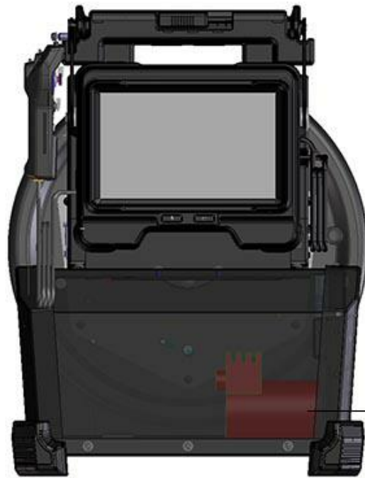
Built-in compact air compressor with anti-dust filter